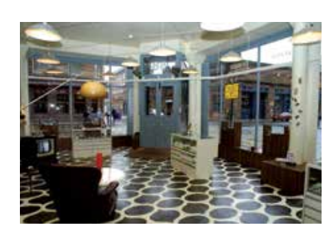
Glasgow (from Gaelic, Glas-ghu meaning Dear Green Place)

If you are a tourist you must take an open topped bus tour, go on a Mackintosh trail, find the Hidden Tearooms, visit Kelvingrove Art Gallery and Museum, walk through the park to Glasgow University admiring the view, stroll along the river Clyde; go to A Play, A Pie and A Pint, lunchtime theatre at Òran Mór; have a drink in a Glasgow pub, enjoy a curry or fine dining with a Michelin star; plan your visit during Glasgow International, Celtic Connections or perhaps the Commonwealth Games in 2014 when Glasgow welcomes the world; and, of course, shop and shop and shop.