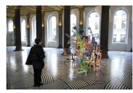
Images / Brazen Jewellery, Hydro Connect music Festival, Jim Lambie's, Forever Changes exhibition at The Gallery of Modern Art in Glasgow